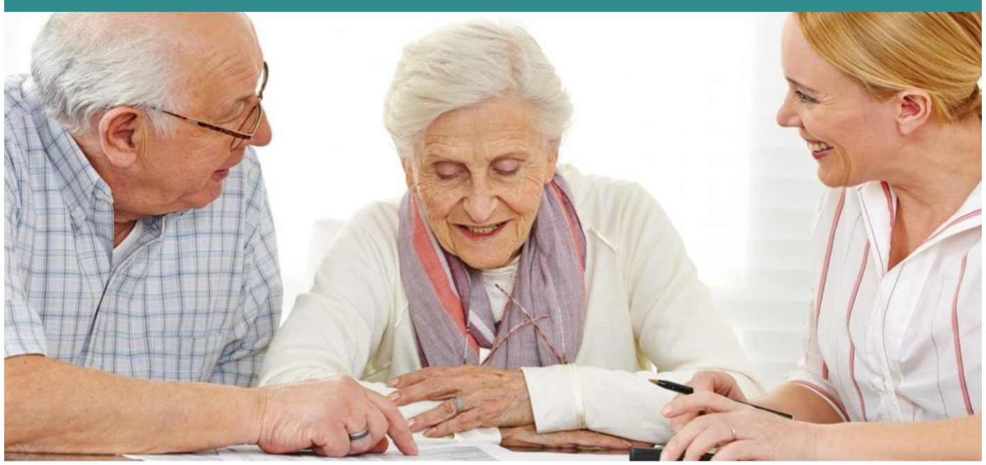
A comprehensive assessment performed in the home and individualized to your specific needs and concerns

Are you caring for parents long distance and want to have a qualified social worker visit them and assess their needs?